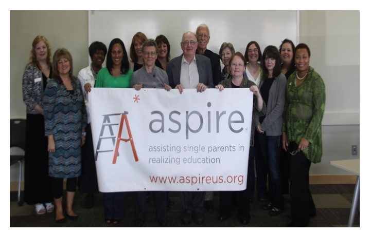
National ASPIRE staff, board members, Affiliate board members and guests

Thank you to all of our attendees and guest speakers for joining us!